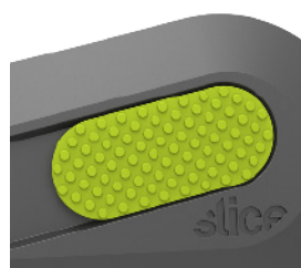
Rubberised comfort blade slider